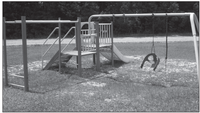
Play is critical for children, yet not all children have equal access to quality outdoor play environments.